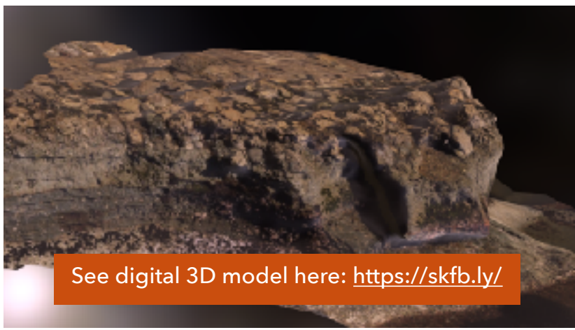
See digital 3D model here: https://skfb.ly/