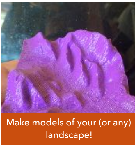
Make models of your (or any) landscape!